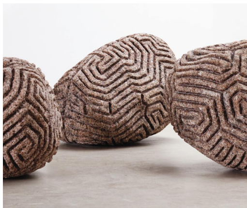
Walking the Dog , Dulwich Picture Gallery

Three galleries will feature new works by leading British Sculptor Peter Randall-Page